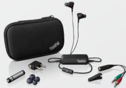
ThinkPad Noise-Cancelling Ear buds