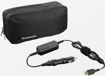
Lenovo® 65W DC Travel Adapter