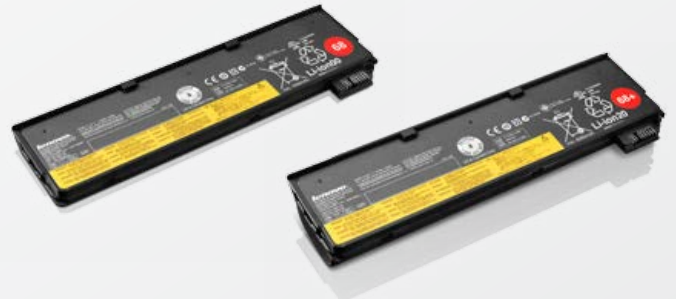
ThinkPad 68/68+ Battery