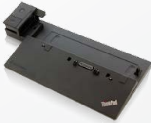
2013 ThinkPad® Docking: ThinkPad Ultra Dock, ThinkPad Pro Dock and ThinkPad Basic Dock