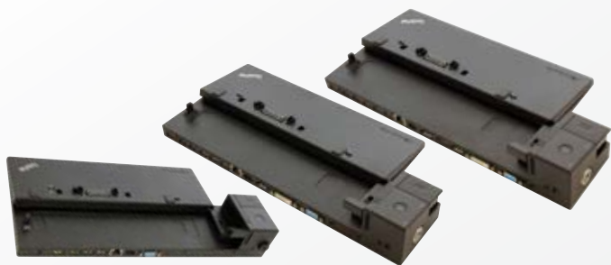
New ThinkPad® Docking (Basic, Pro, and Ultra)