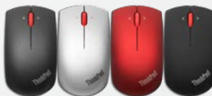
ThinkPad® Precision Wireless Mouse