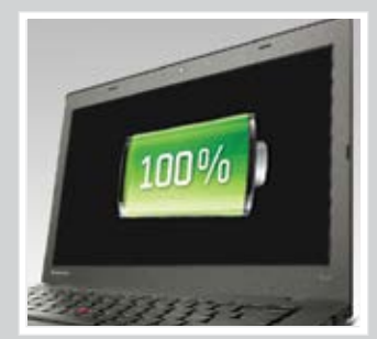
LONG-LASTING PERFORMANCE More than 10 hours of battery life