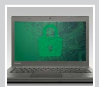
SIMPLIFIED USABILITY Intel® vPro™ makes security and management simple and easy