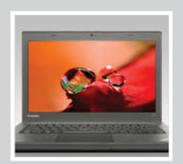
SUPERIOR DISPLAY 14" HD, HD+ screen with multitouch capability for clear and sharp visuals