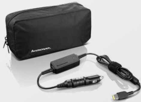
Lenovo® 65W DC Travel Adapter