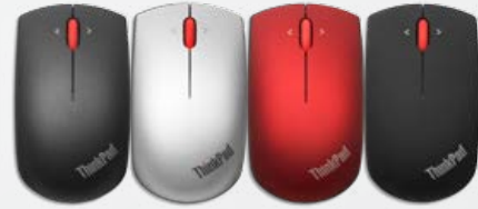
ThinkPad Wireless Precision Mouse