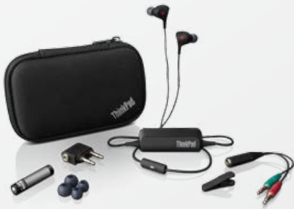
ThinkPad Noise-Cancelling Earbuds