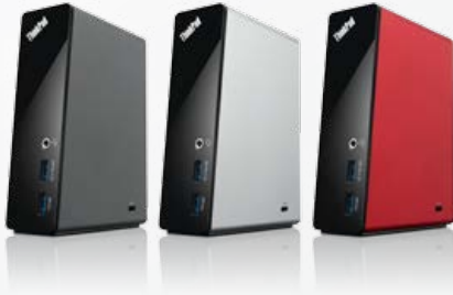
ThinkPad® OneLink Dock