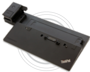
Ultra Dock Docking Station