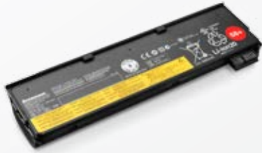
ThinkPad® Power Bridge Battery