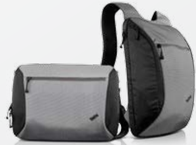
ThinkPad® Ultralight Topload and Backpack