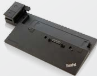
ThinkPad® Docking 2013