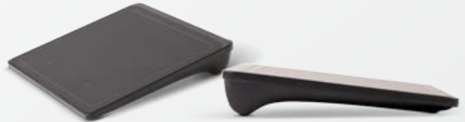
Lenovo® Wireless TouchPad