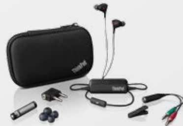
ThinkPad Noise-Cancelling Earbuds