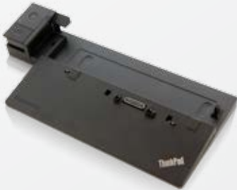
New ThinkPad docking for security, connection, and power