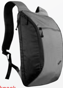
ThinkPad® Ultralight Backpack